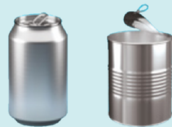
CANS AND TINS