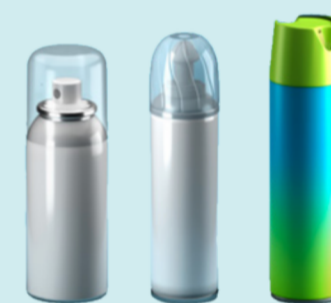
AEROSOL SPRAY CANS