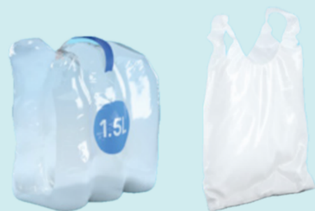
FILMS & BAGS