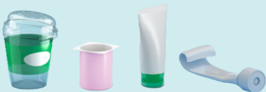
JARS, POTS & TUBES