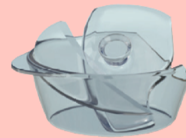
HEAT-RESISTANT GLASS (OVEN DISHES, ...)