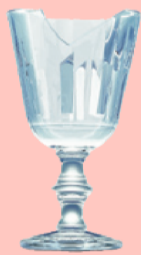
MILK GLASS AND CRYSTAL (OPAL WHITE BOTTLE, WINE GLASS,...)