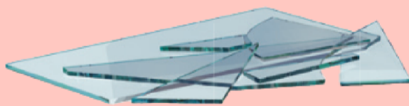
FLAT GLASS SUCH AS WINDOWS AND MIRRORS