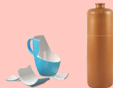
PORCELAIN, CERAMICS, TERRACOTTA (MUGS, PLATES, ...)